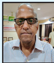
I. Ananda Rao Gadevari Street